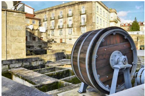
Historic 'Ilha do Sabão' - once housing leather manufacturing workers, now a charming tourist accommodation owned by a local leather entrepreneur family (left) and a Glimpse into Leather Tanning Artistry in Couros (right) by National Geographic