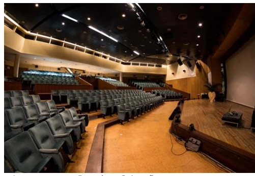
Azurem campus. Fotos by + Guimarães

Campus de Azurém, Alameda da Universidade, 4800 - 058 Guimarães, Portugal GPS Coordinates: [latitude: 41° 27′ 6.85″ N - longitude: 8° 17′ 33.19″ W] View on Map