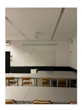
Couros campus.

Couros, a region in Guimarães, has earned its place on the UNESCO World Heritage List as an extension of the Historic Center of Guimarães. The recognition came after years of effort by the municipality to demonstrate the historical and cultural significance of this area. It's worth noting that Guimarães' Historic Center had already been a UNESCO World Heritage Site since December 13, 2001.